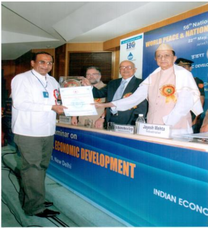
Receiving the National Indian Achievers Award for Health Excellence